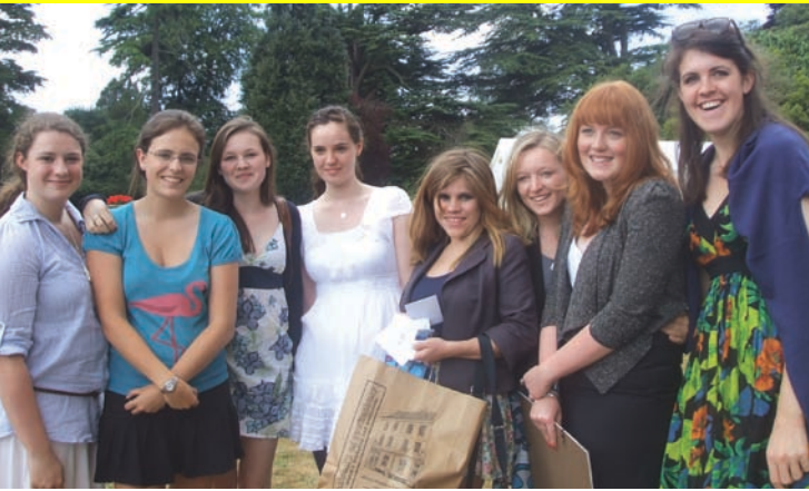
Exciting times ahead for 6th Form leavers