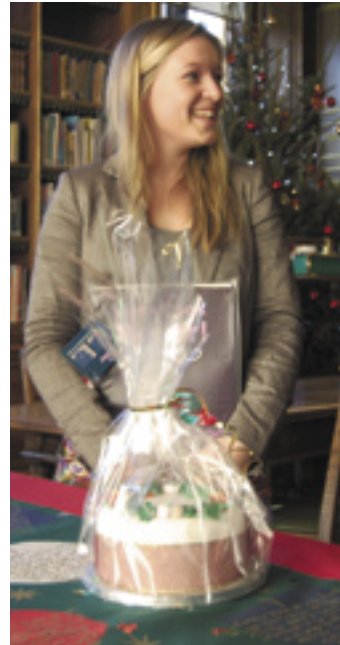
Making Christmas cakes is a highlight of our Leith's Food and Wine Course in the Sixth Form

At Westonbirt we enjoy sharing different cultures with each other and with the local community. Last term we helped the nearby Hawkesbury Primary School expand its pupils' horizons during their International Week (left) We introduced the Beaver Colony of First Dursley Scouts to new friends from overseas who explained how the Scout movement operates in their home countries to help them earn their Friendship Badge. We enjoyed a Japanese cookery demonstration (right). We are now looking forward to our International Day celebrations on April 23rd - St George's Day!